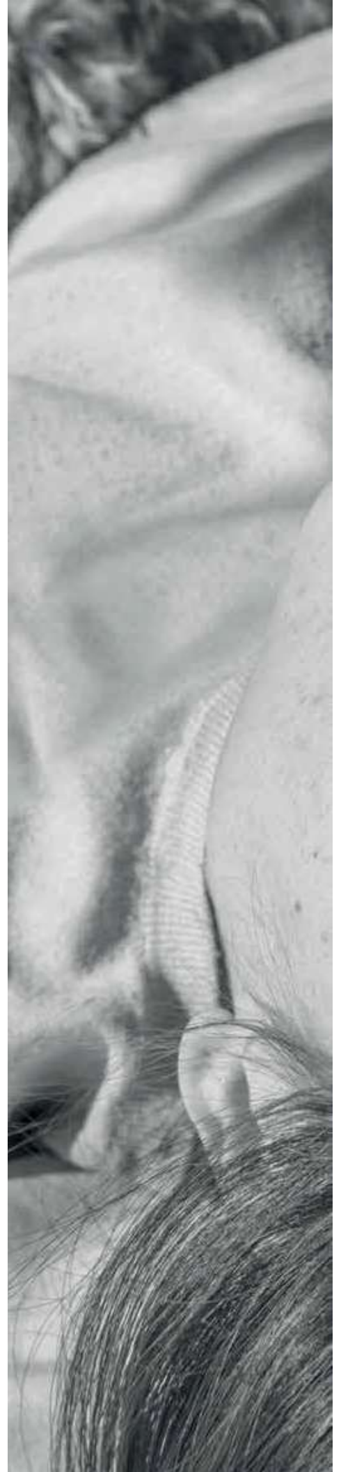
Above: Julie #1 from Rayon Vert and, right, Anais #1 from Rayon Vert

B UILDING ON THE THREE previous editions, Photo London 2018 promises a compelling look at the past, present and, perhaps most importantly, future of photography.