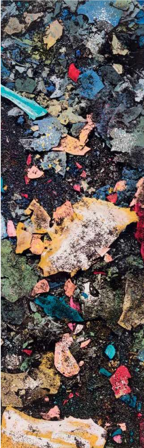
Right: Threshold 4